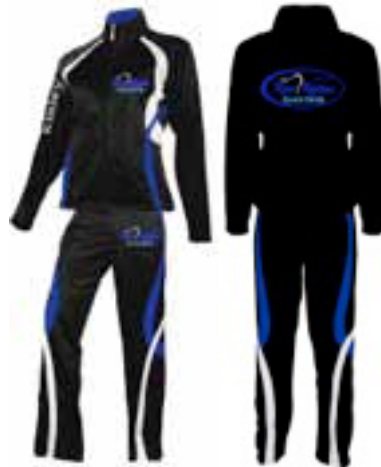
RRDC Team Jacket and Pants

NEW Chevron Infinity Scarf with RRDC Logo