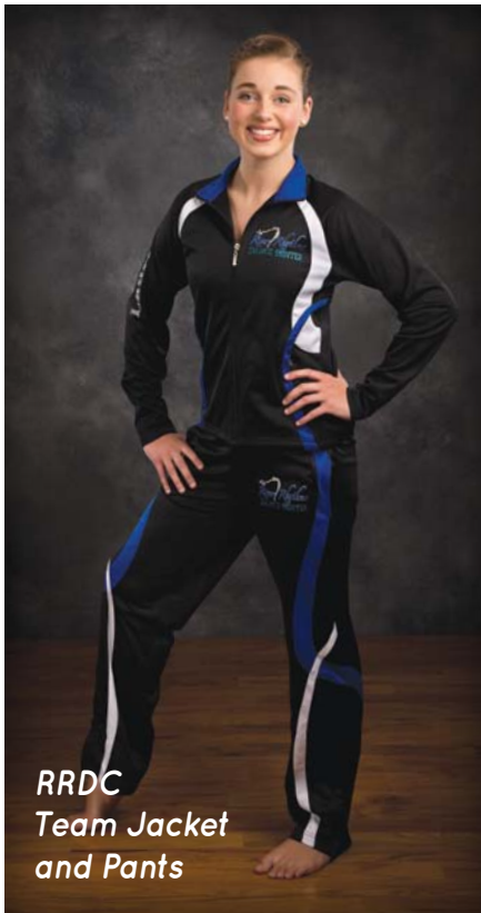
RRDC Team Jacket and Pants